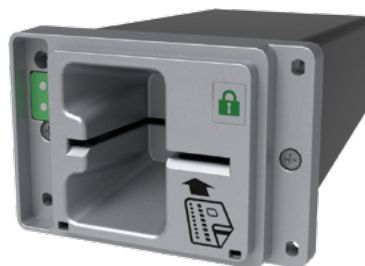
EMV hybrid chip card reader