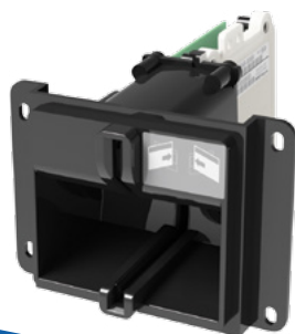
Standard mag-stripe card reader

The Wayne Fusion site automation server enables EMV transaction security and electronic payments indoors. Plus, the Wayne iX Pay secure payment platform allows for a smooth transition to EMV due to simple, cost-effective upgrades via a la carte reader kits. Conversion to EMV may also be as simple as replacing the existing mag-stripe reader with a hybrid chip reader and completing an application software update whenever your POS and network are ready.